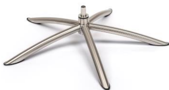
TS Tube Space base - brushed