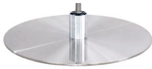
DBB Disc Metal brushed