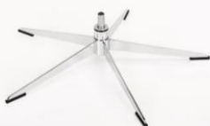
OS Orion-Base - Chrome