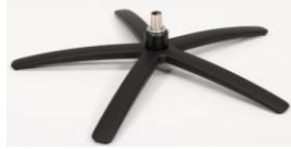
SBS Sirius Base - Black