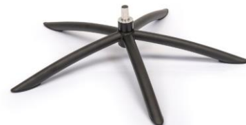
TSS2 Tube Space base - black