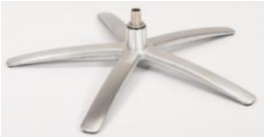
SB Sirius Base - Brushed

Gas lift for Elegant Base (EB/EBS) Sirius Base (SB/SBS) available!