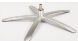
SB Sirius Base - Brushed

Gas lift for Elegant Base (EB/EBS) Sirius Base (SB/SBS) available!