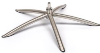
TS Tube Space base - brushed