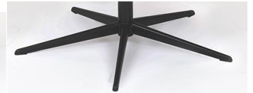
PBS Polaris-Base - Black