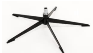
OSS Orion-Base - Black matt