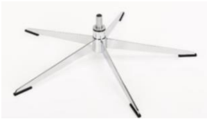
OS Orion-Base - Chrome