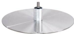
DBB Disc Metal brushed