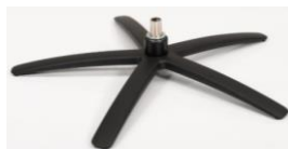
SBS Sirius Base - Black