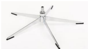
OS Orion-Base - Chrome